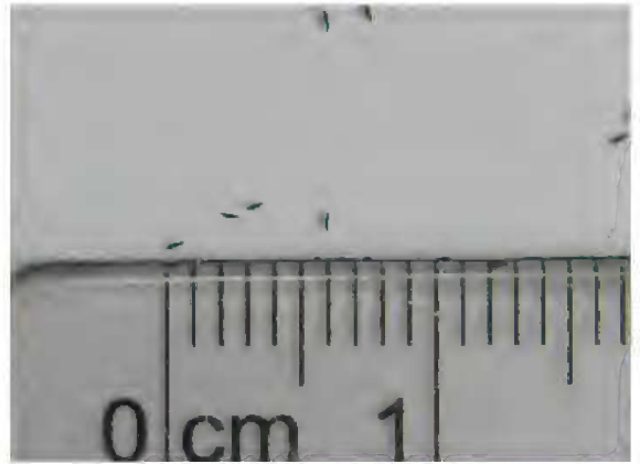
Figure 4: Hover fly pollinating the flowers (left) and tiny fusiform Drosera slackii seeds (right). which have no fragrance. One can only assume that this acts as an attractant for insect prey, but I have found no reference to it elsewhere.

In early summer, tall wiry glandular stems (Fig. 3) to approximately 50 cm are produced with 20-25 bright purple-pink flowers to 1.25 cm in diameter, each with 6 bifid stigma tips, and each opening for a single day (Fig. 3). I have seen the flowers pollinated by hover flies in the nursery (Fig. 4).